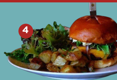
4. Bobs Burger, $15 My Restaurant 123 Center St., Red Wing

Supply high-resolution, high-quality image of the item/food, name of item/food, price, and your company name and address.